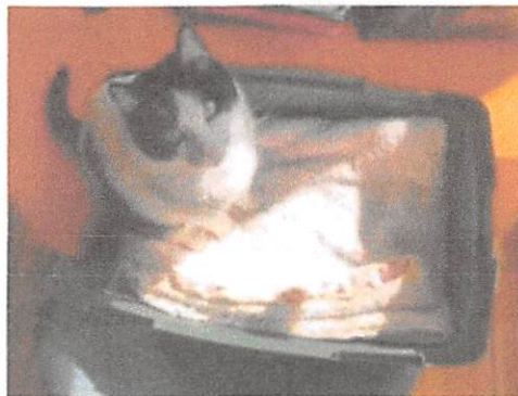
A cat being introduced to the bottom of a carrier.

How to train your cat to love their carrier